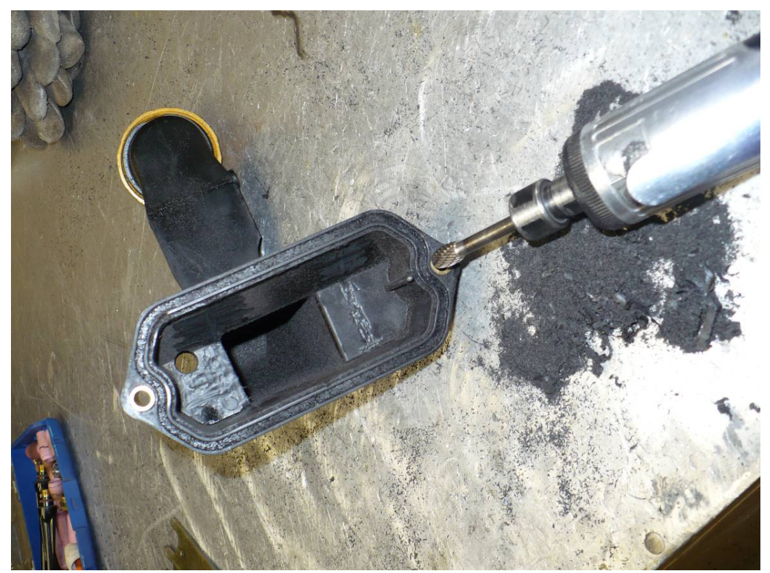
The oil fill/breather box is now ready to be installed over the air/oil separator scrubber box.