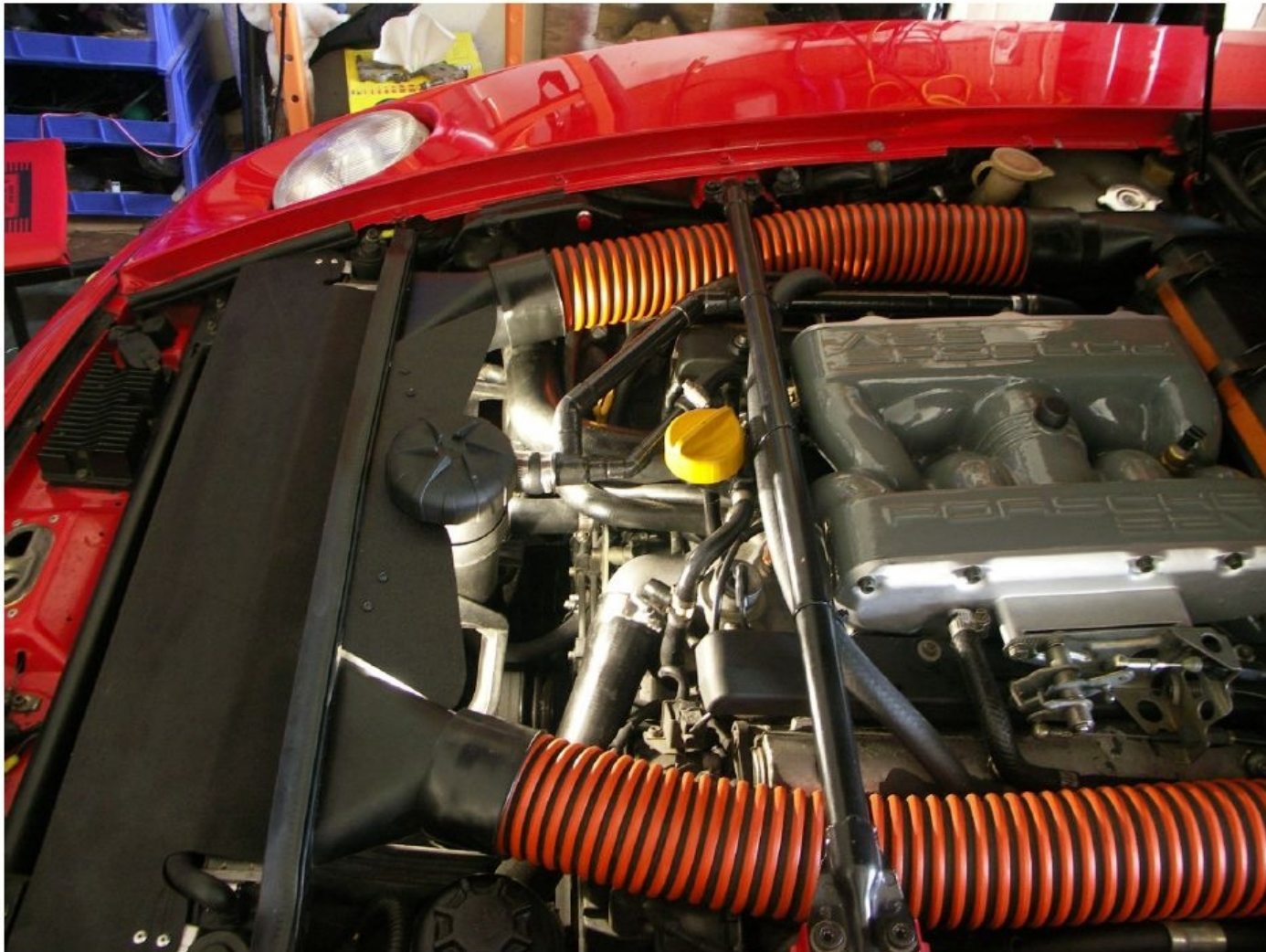
Overhead view of optional Provent cover plate with optional LED light kit and lights on during day light hours