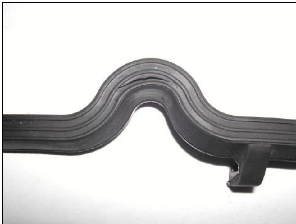
Photograph of LHS of oil pan gasket showing smaller split

The LHS split was parallel to the ribs and did not cross over the centre rib, so the centre rib made a seal.