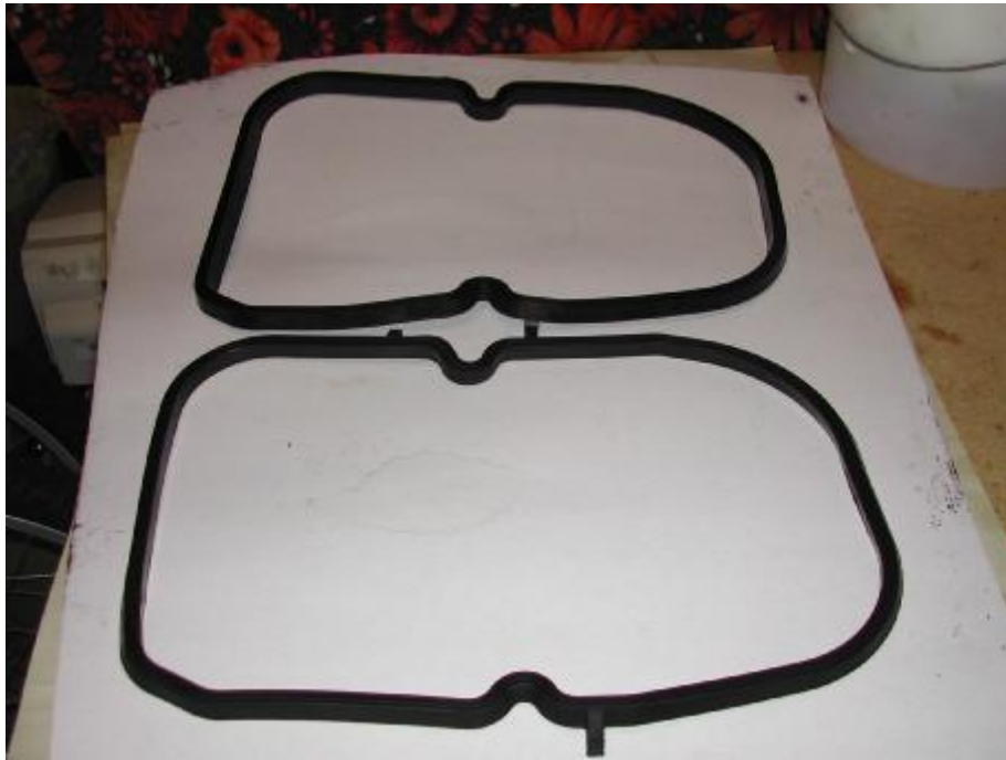
Photograph of fail Oil Pan Gasket in foreground and new 1180 more substantial gasket at the rear.

The current proposal is to run the car with the existing 10 80 old design gasket and see whether it fails. If it does not fail it will be left in situ, however if it starts to leak it will change it out for the modified 11 80 gasket.